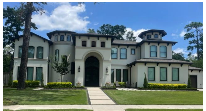
Gorgeous 12922 Figaro

For more tips, check out FEMA's Hurricane Preparedness Guide here .