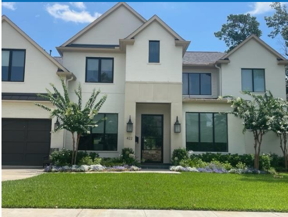
Beautiful 422 Gretel