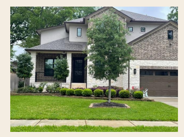
Gorgeous 407 Faust

Text Erica Jordan at 713-409-0222 to retrieve your decal.